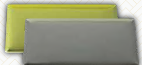
Beveled Frame $7.95