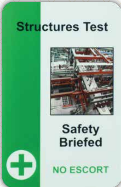
FC-200 -Non Personalized Digitally Printed Badge Mono White Material, .030" Thick