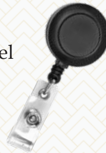
Badge Reel $3.35