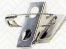
Pin/Clip Combo $1.50