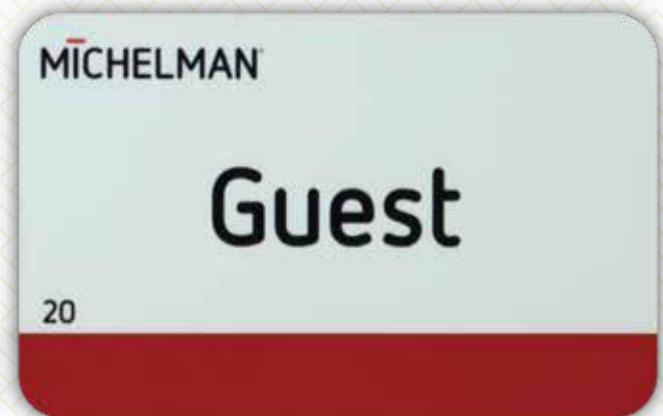
FC-200 -Non Personalized Digitally Printed Badge Mono White Material, .030" Thick

The price includes a full color design printed on a white card in the standard size. We can custom cut to size and attachments are available.