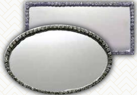
Rhinestone Frame $25.00