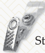
Strap Bulldog $1.00