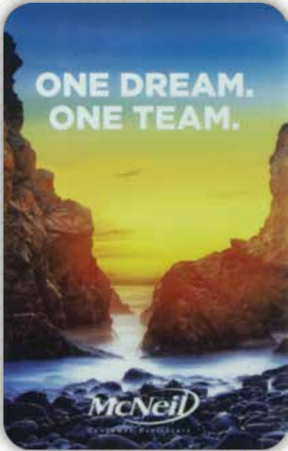
FC-200 -Non Personalized Digitally Printed Badge Mono White Material, .030" Thick

Non personalized badges are perfect for membership cards, emergency information, loyalty cards, mission statements, or ANY SITUATION YOU NEED EVERYONE TO HAVE THE SAME INFORMATION.