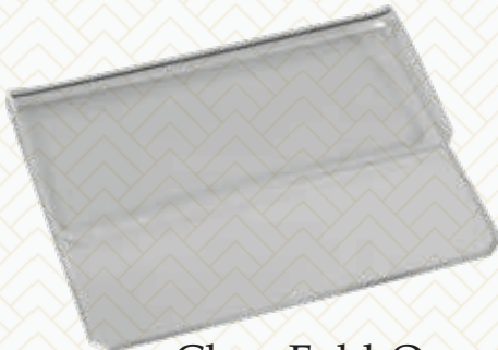
Clear Fold-Over $3.35