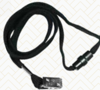
Bulldog Lanyard $1.50