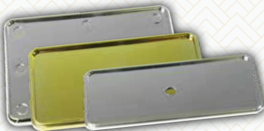
Rounded Frame $5.00