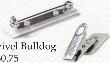
Pin or Swivel Bulldog $0.75